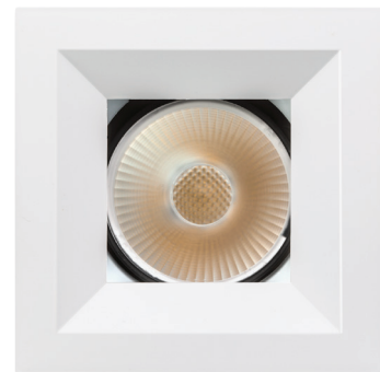
1.625" x 1.625" 1-Head Bevel Trim