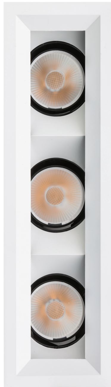
1.625" x 9.625" 3-Head Bevel Trim