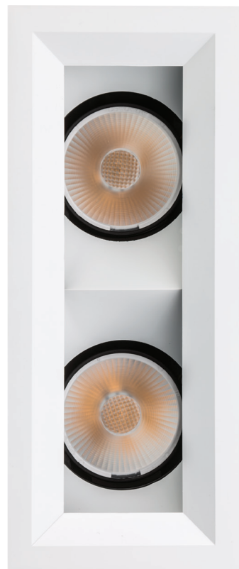
1.625" x 6.125" 2-Head Bevel Trim